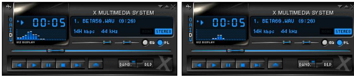
Figure 3: Screenshots of the low-lying part of the spectrum of the Dirac operator in the confinement and deconfinement regions.

of data analysis, in particular, from graphical visualization. In this regard, sonification as applied here can be seen as an additional tool of data representation. Of course, one should find more refined means of auditory display in order to make further qualities apparent in some given data sets. Sonification offers the chance to detect structures in the data sets that have been hidden to the methods applied so far. Data analysis through sonification might especially be useful for displaying results depending on multiple parameters and/or belonging to higher space-time dimensions. In the context of lattice QCD one could think, e.g., of the investigation of the topological content of certain gauge field configurations.