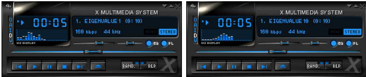
Fig. 3: Screenshots of the lowest and the 10 th eigenvalue of the Dirac operator from the confinement to the deconfinement regions.

In the sonification process we modified a sclang code from another sonification project treating baryon spectra obtained from different constituent quark models [6]. In Fig. 3 we present screenshots of the 1 st and the 10 th eigenvalues from \beta = 5.0 to \beta = 6.0 . Listening to the sound files one can hear that the so-called melody is changing clearly to higher tones around the critical \beta -value. Both eigenvalue sequences behave similarly. Only the quasi-zero mode of the lowest eigenvalue starts around 440 Hz whereas the higher eigenvalue begins correspondingly higher. This means that one can hear the restoration of chiral symmetry when increasing the coupling beyond the phase transition to the quark-gluon plasma. These sample results are stored on the SonEnvir server and can be accessed there [7].